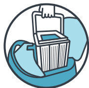
Top load filter basket